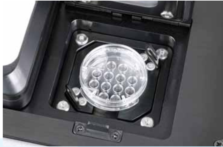
*Designated dish is commercially available worldwide at an affordable price.