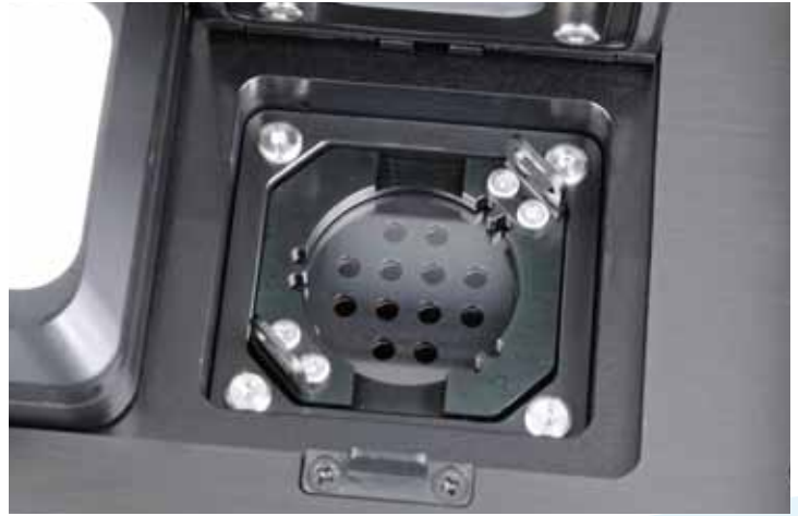
Small & completely separated incubation chamber with a unique dish holder.

The upper Lids have been skillfully built with grade A Japanese Steel, curved to perfection, which allows extra room & flexibility to the user, while opening and closing the chambers. (The Red LED Light Source is built & engineered securely into the lid.)